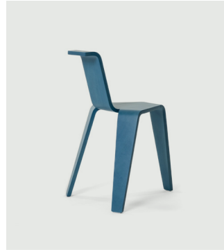
Stained petrol blue 7151