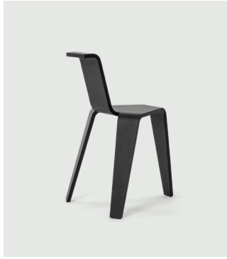
Stained black 7140