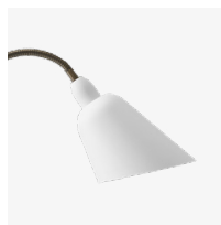
→ White with Bronzed Brass