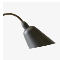
→ Stone Grey with Bronzed Brass