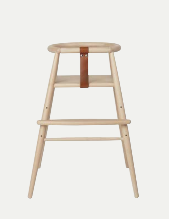
ND54 Beech lacquer / Saddle leather strap