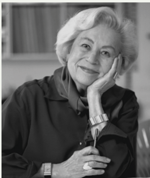
Nanna Ditzel was a prolific Danish designer who worked in the fields of furniture, cabinetry, textiles, jewelry, and tableware. She is remembered as a pioneer of design for children.

Although the Ditzels created a number of children's furniture pieces together, the High Chair is widely regarded as their masterpiece. Handcrafted in solid beech, the High Chair has been designed to adapt to the changing needs of growing children, so that the chair can be used by children up until the age of five. Each High Chair is beautiful and durable enough to be handed down for many years of use.