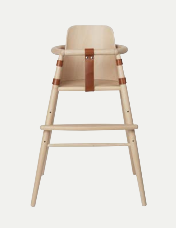
ND54 with baby seat Beech lacquer / Saddle leather straps