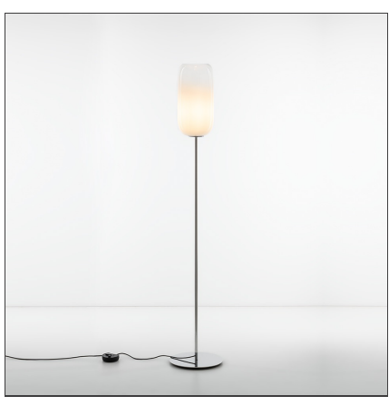
IP20 (≟) 🐒 s c€