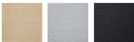
Ash Natural Ash Grey Ash Black