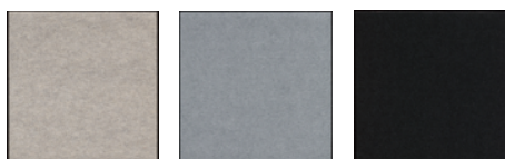
Beige Grey Black