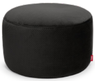
Made from recycled materials