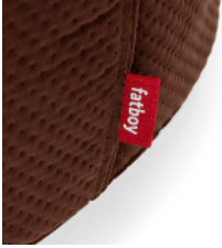
Easy to clean