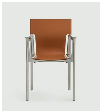
Polished / Natural