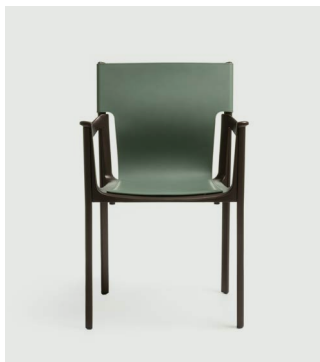
Dark bronze / Blue sage