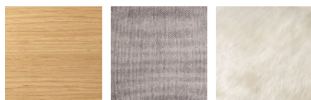
Oak Sand Ivory