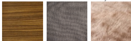
Walnut Mocca Taupe